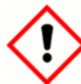
Harmful or Irritant